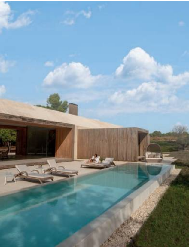
ARENA COLLECTION | LOUNGERS + DAYBED