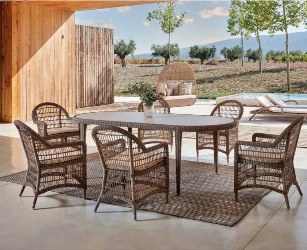
ARENA COLLECTION | DINING