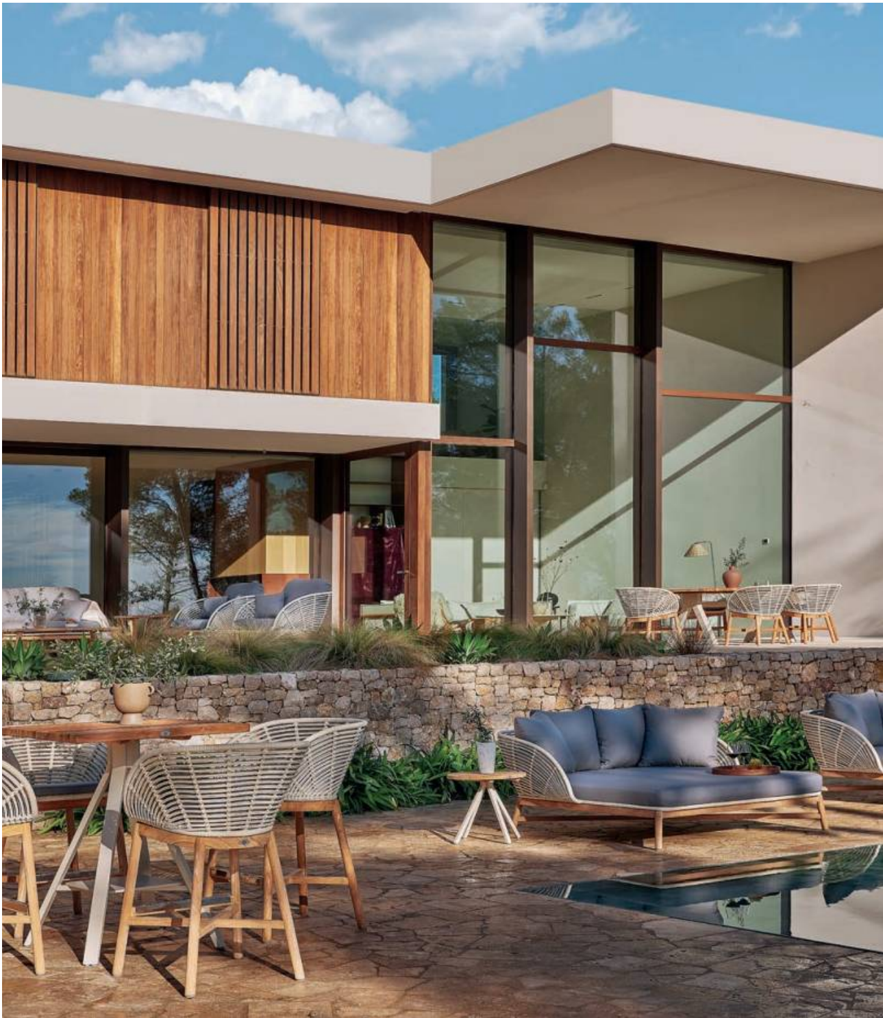
ALASKA COLLECTION | LIVING

In this new collection we combine natural tones with teak. The contrast between textiles, the back and the legs makes this one of the most interesting and appealing collections.