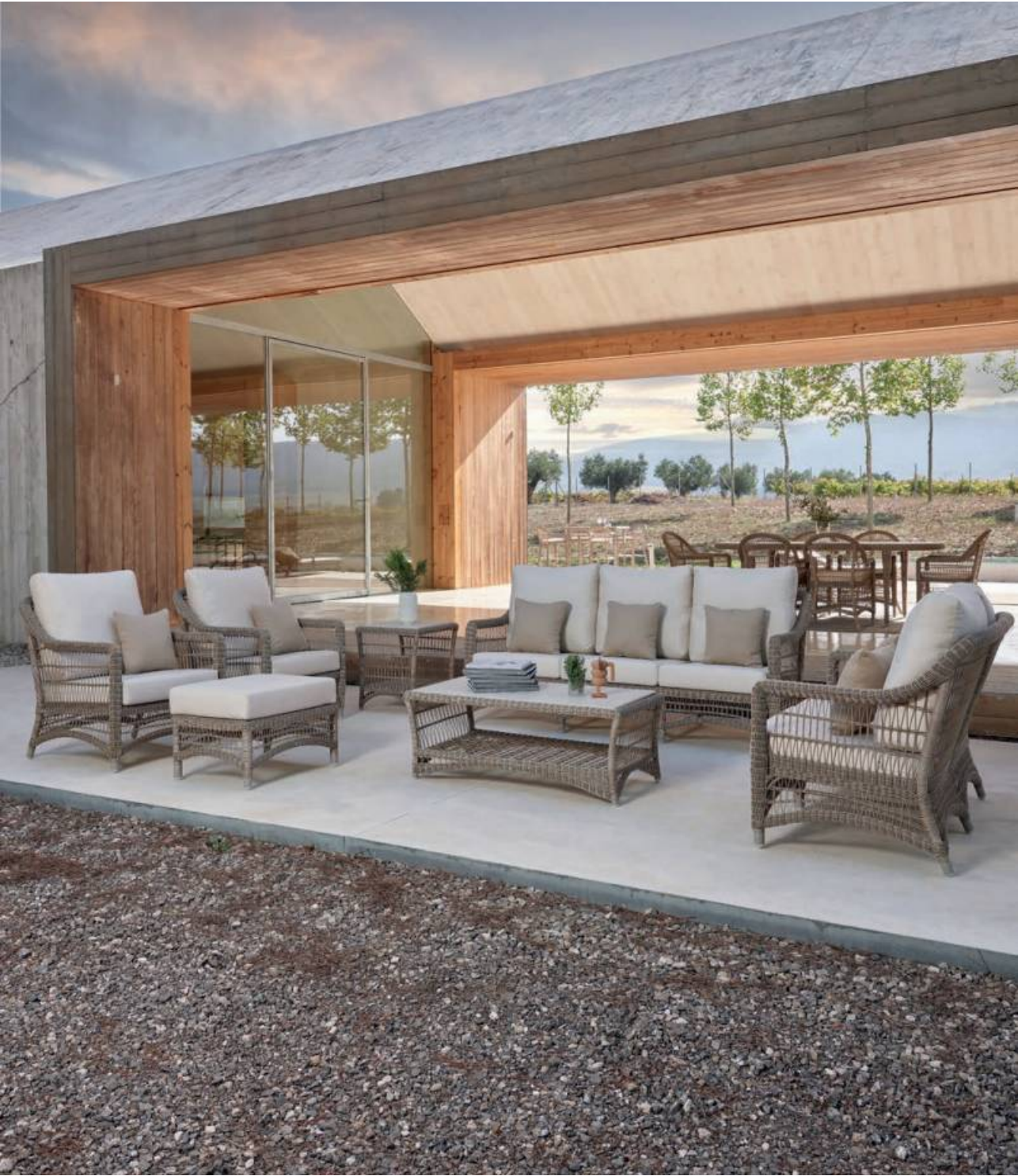
ARENA COLLECTION | LIVING

With this collection we unite modernity and tradition. We take the classic design of the braid, and we bring it to contemporary pieces that are made to stand out. The perfect option to decorate relaxed spaces.