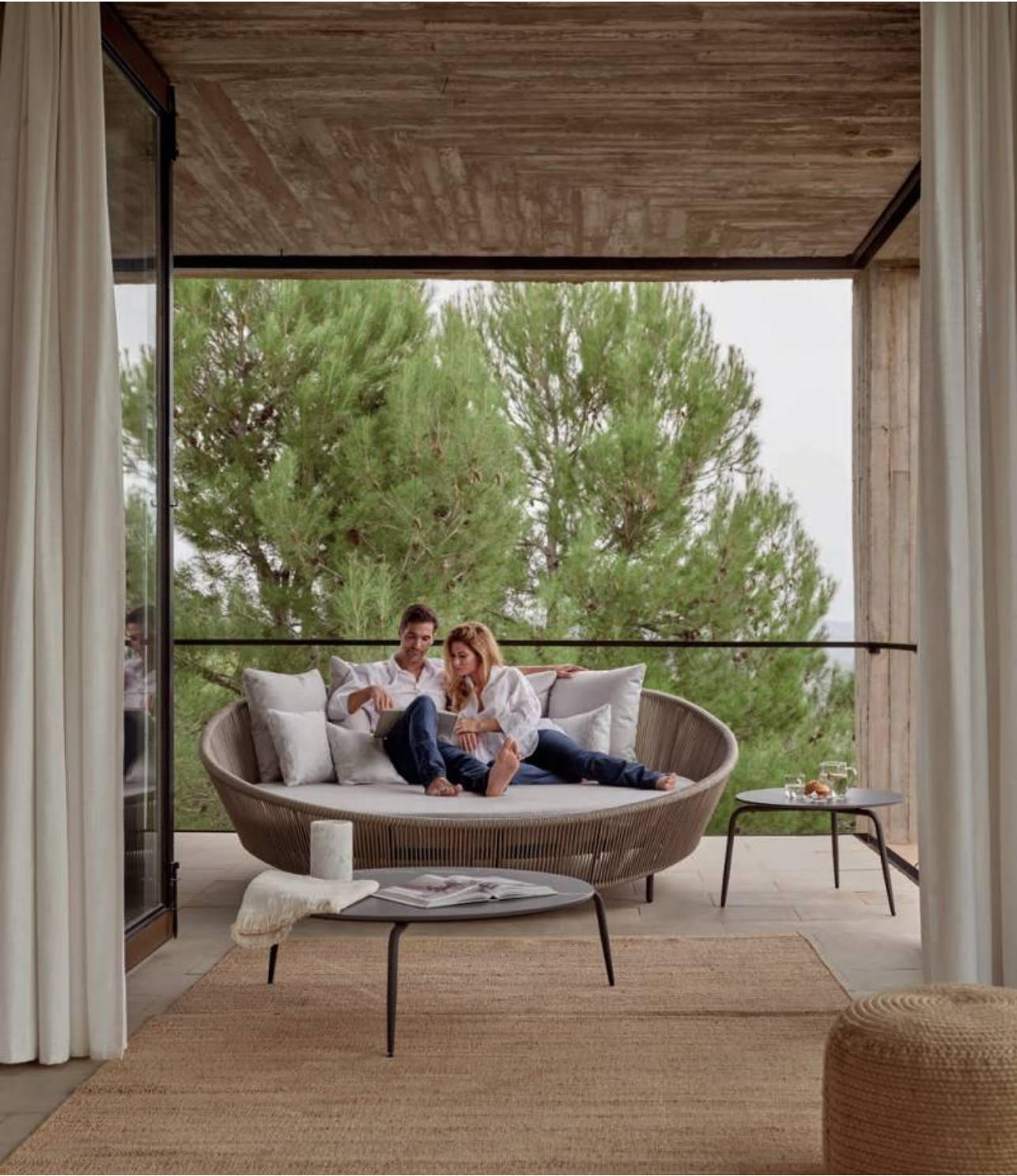
RODONA COLLECTION | DAYBED

This collection, designed by Santiago Sevillano, stands out because of its comfortable and large seats. Greatly versatile pieces that adapt to every space, thanks to their timeless aesthetic.