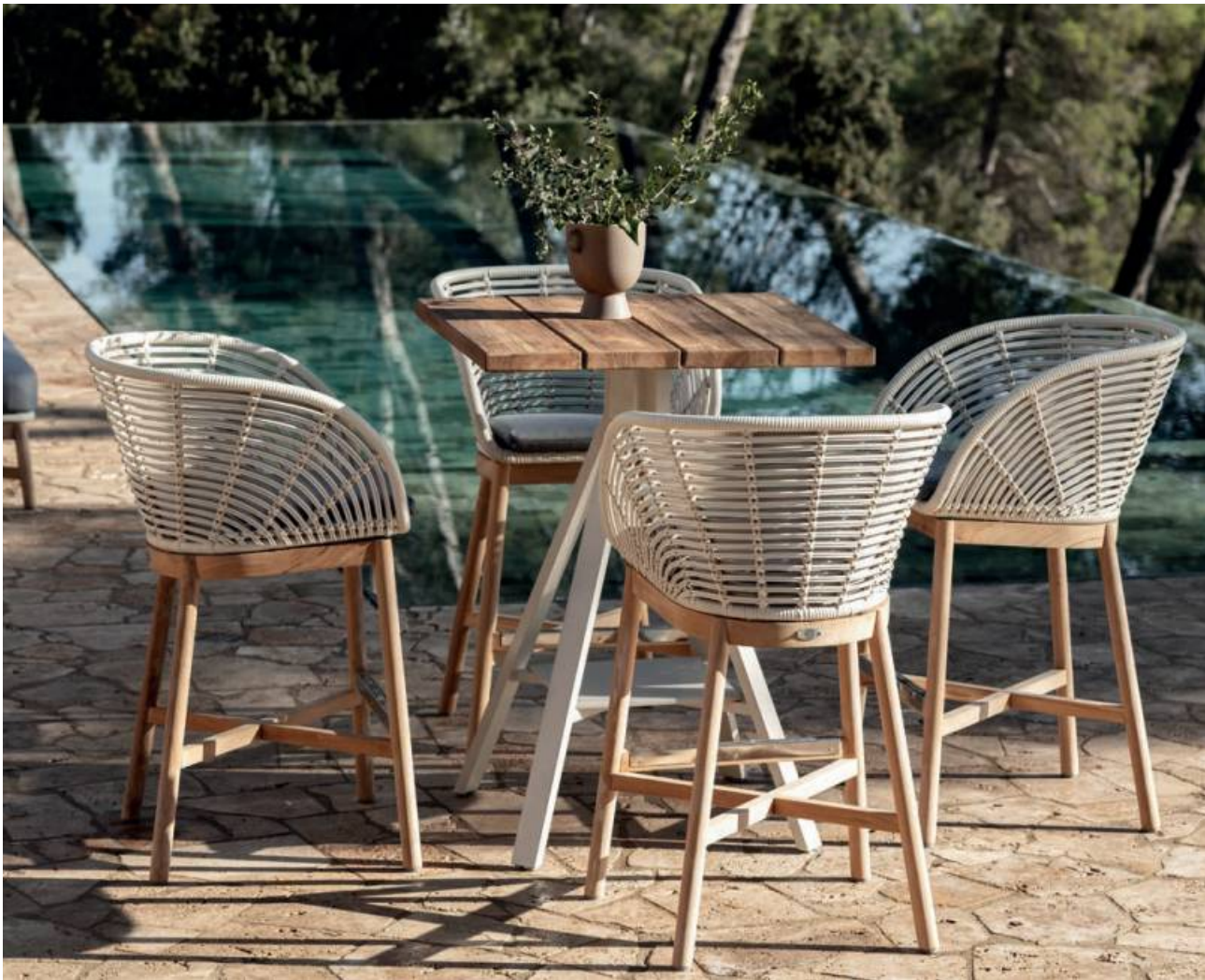
ALASKA COLLECTION | BARSTOOL + BAR TABLE