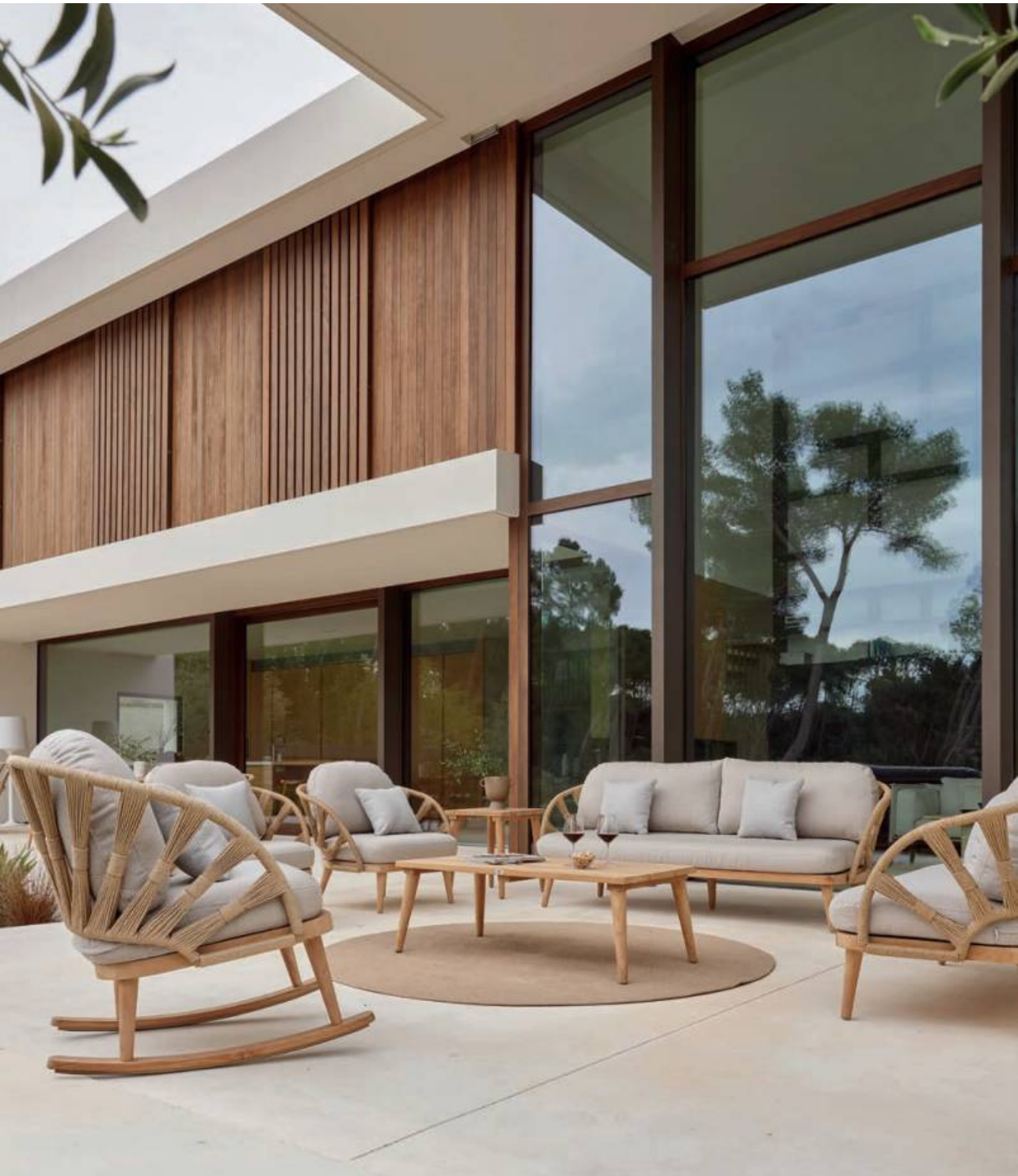
KRABI COLLECTION | LIVING

This collection represents the perfect combination of pure lines with the sinuosity of the braid that allows to glimpse the structure of the pieces. The light skeletons give this collection a sophisticated architectural look that makes it the perfect choice for the trendiest spaces.