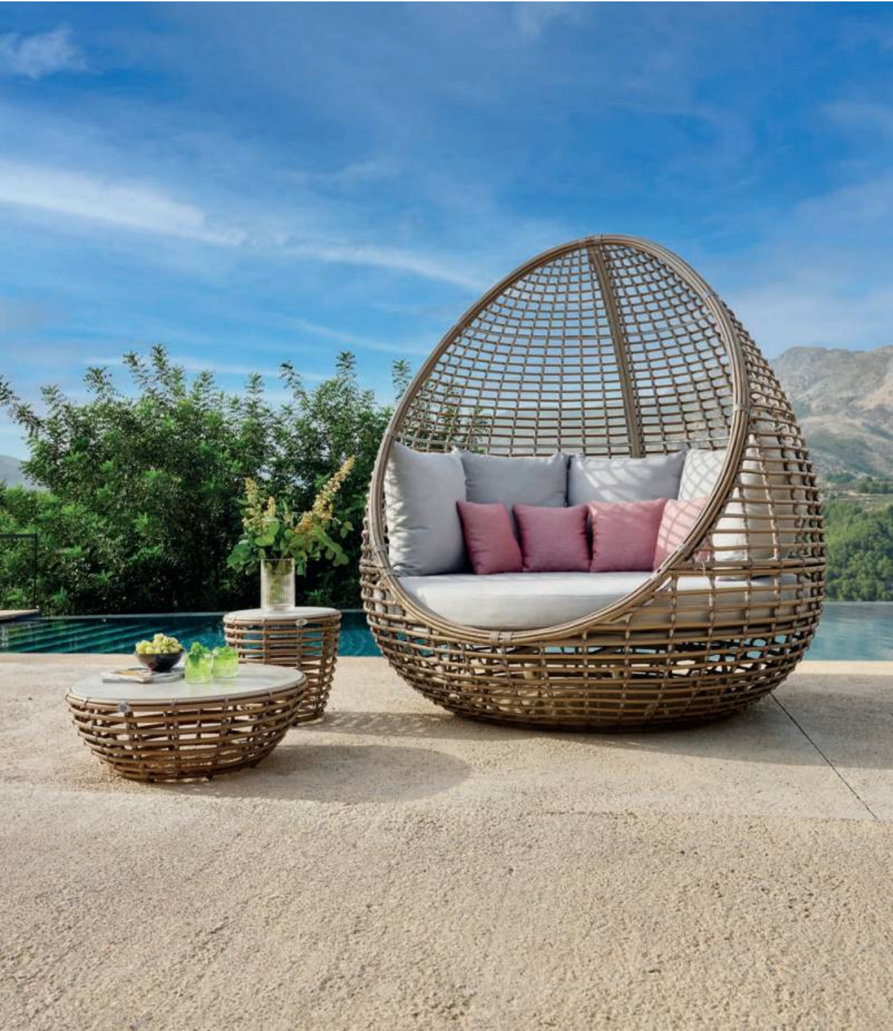
FABER KUBU BETTA | DAYBED

A trend that, to us, is now a classic. More than a piece, an experience to whom enjoys it. Feeling the calmness through the natural materials and design. Dreaming awake is now possible.