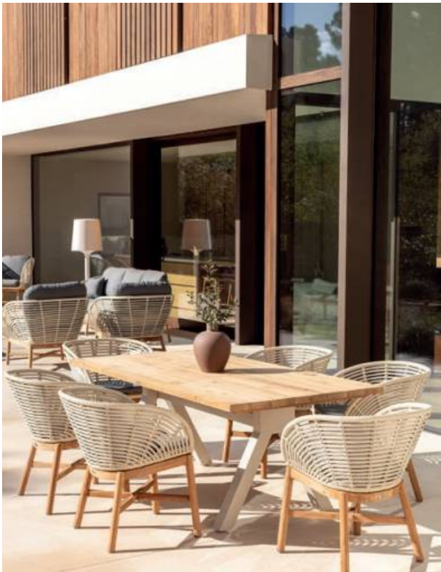
ALASKA COLLECTION | DINING