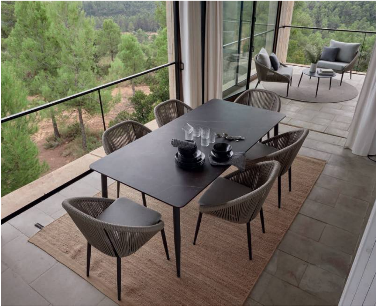
RODONA COLLECTION | DINING + BALCONY