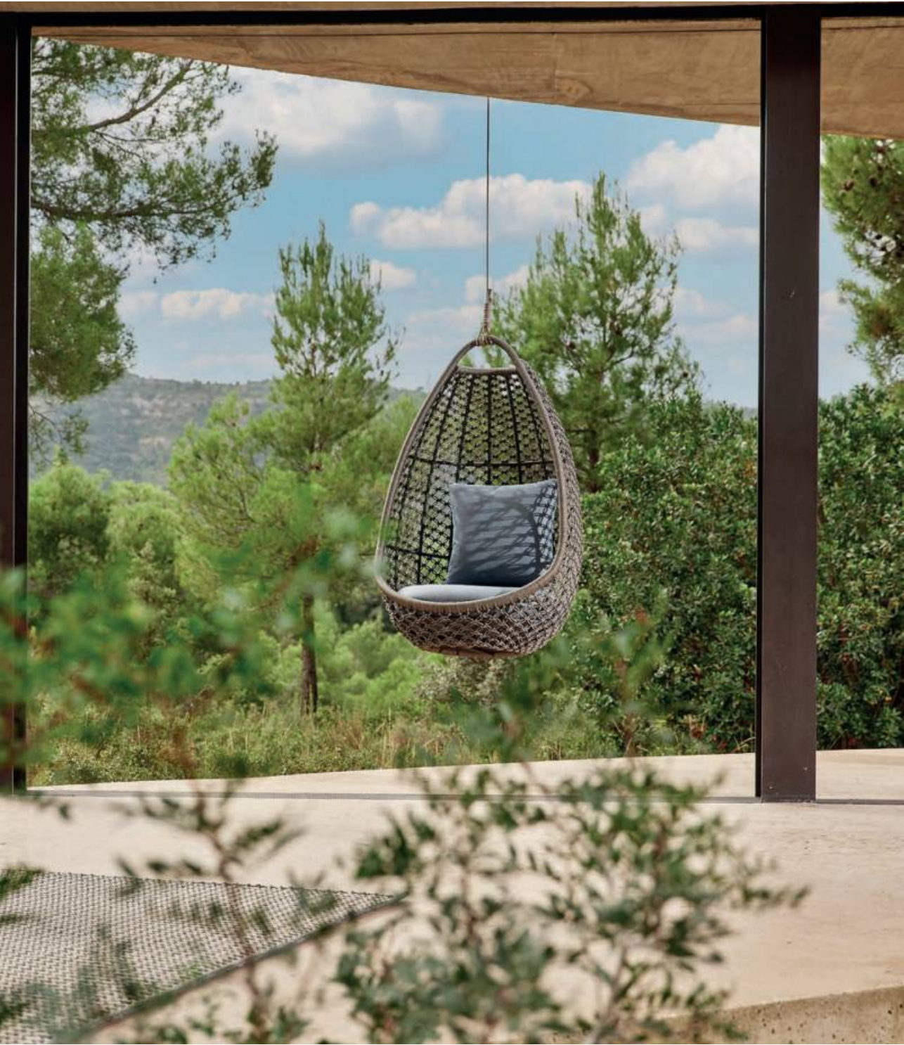
MOMA COLLECTION | HANGING CHAIR

This collection is one of the most recognizable due to its defined style. The contrast between the materials used stands out, as well as the big size of its seats, contributing to its comfort.