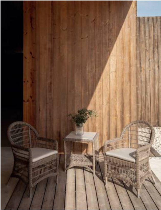
ARENA COLLECTION | BALCONY