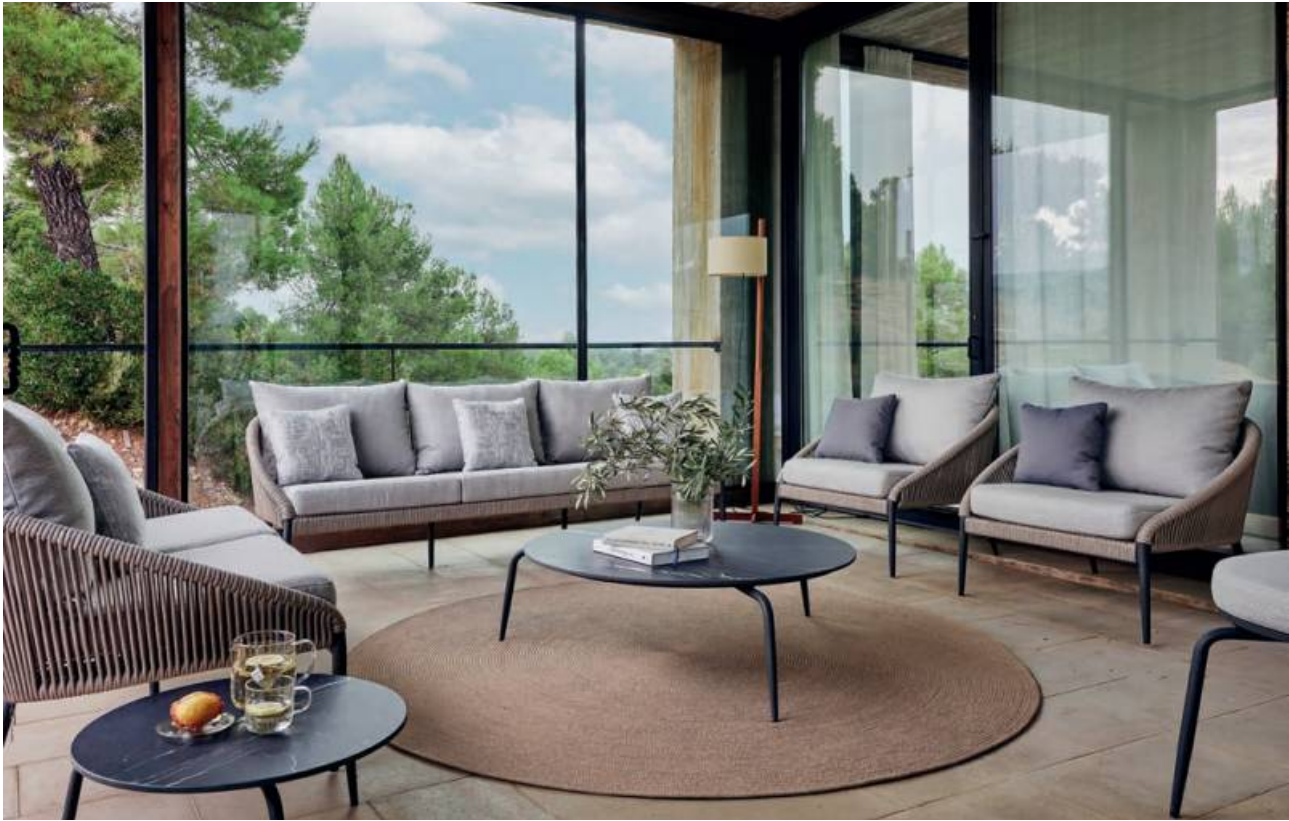
RODONA COLLECTION | LIVING