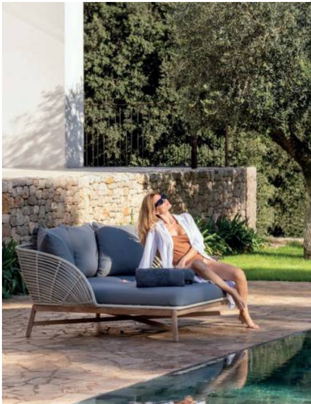
ALASKA COLLECTION | DAYBED