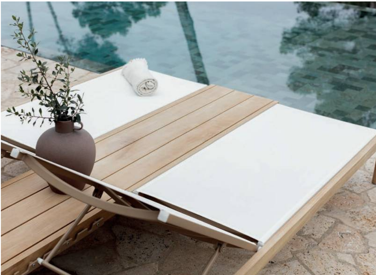
KRABI COLLECTION | LOUNGERS