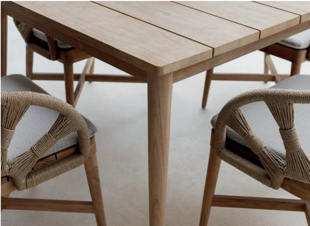
KRABI COLLECTION | DINING